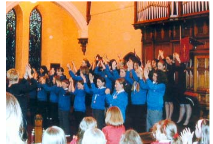
Members of the Girls' Brigade - 2nd Bathgate Company - hold a signed singing display night and raise £250 for Kisoro.