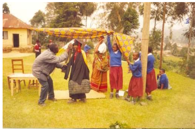
Scene from Act III: Deaf child returning to father's home after graduating from University.

Deaf pupils also took part in a dramatic performance, promoting to the audience the message that deaf children can access education and perform just as well as do their hearing counterparts.